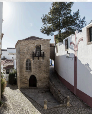
Arched bridge linking buildings